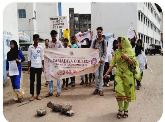
Best Practice 01: Cotton Bag Distribution